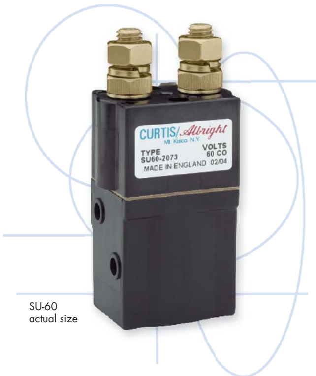
SU-60 actual size