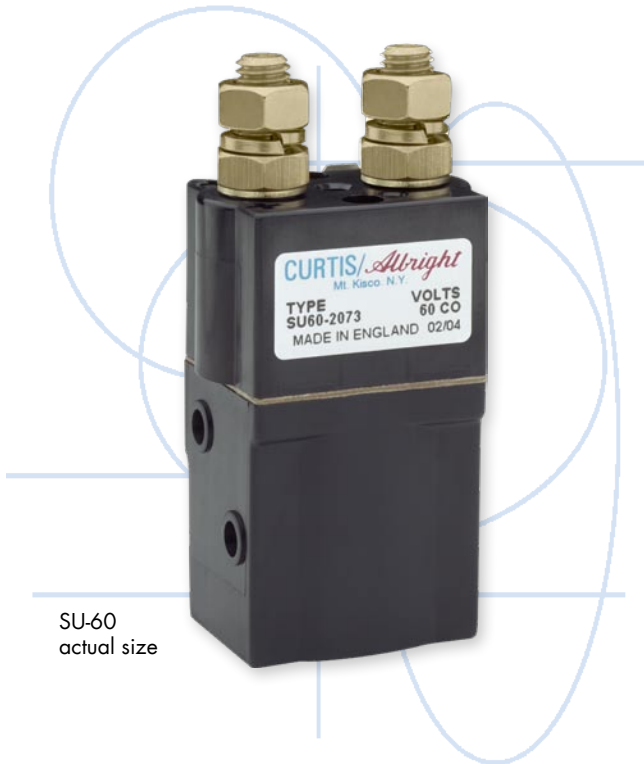
SU-60 actual size