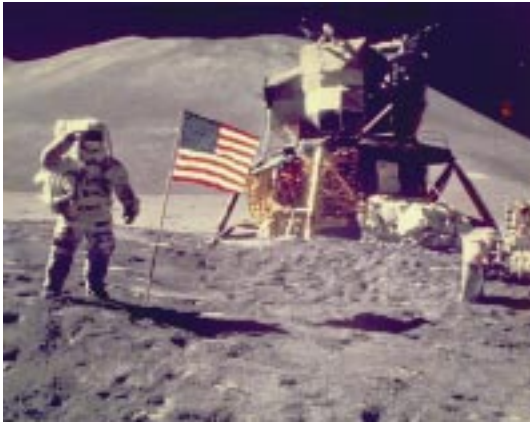
Curtis hour meters were used by NASA in the Apollo project to monitor all major electronic systems. More than 40 Curtis hour meters were installed in the space vehicles- and over 20 are still on the moon today, left behind on the moon with the descent module.